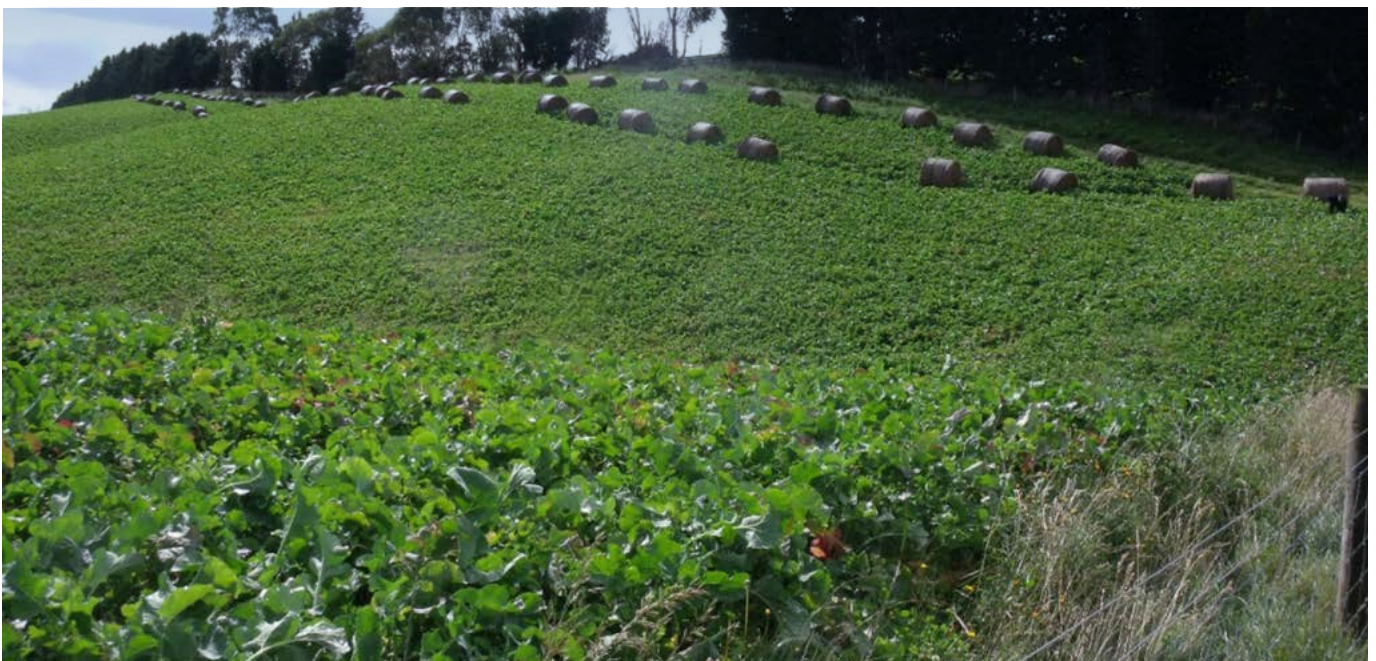
Figure 1. Supplementary feed placed in a crop paddock prior to grazing when the soil is still dry. This minimises heavy vehicle use on wet soils in winter.