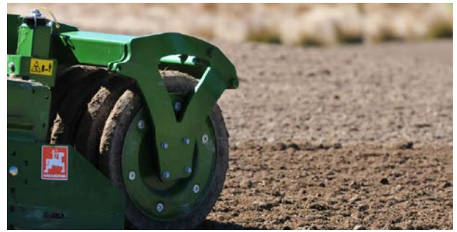
Figure 2. A winter feed crop paddock being cultivated and sown.